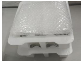
Same way to 2nd layer.