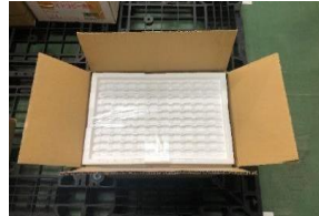
Put into a carton box.