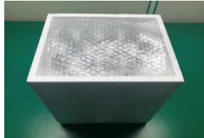
Putting an air mat on top layer