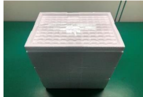
Putting a empty tray and taping.