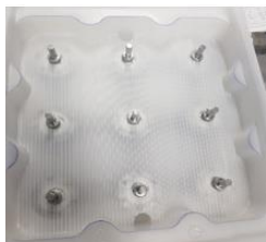
Putting plastic board.