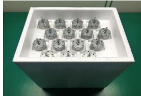
Also each 15pcs at 2-3layer.