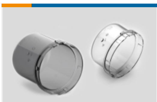
Street Lighting Accessories(18)