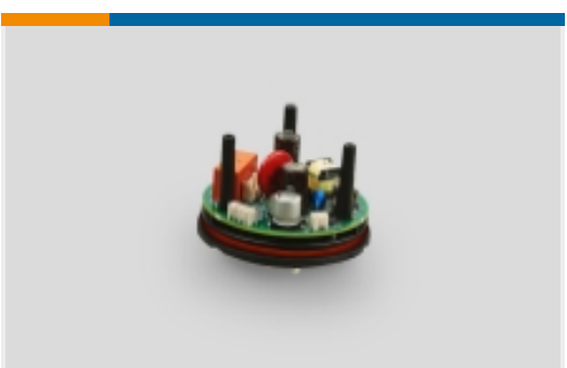
Street Lighting Power Management(6)