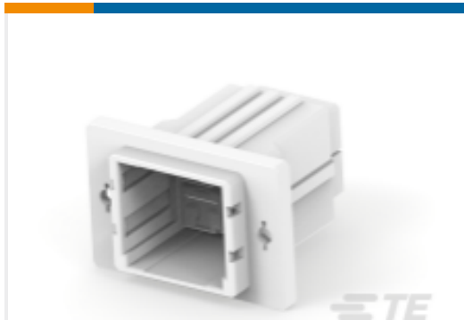
TE Part # 1-917808-2 DYNAMIC 5000 REC AND TAB HSG