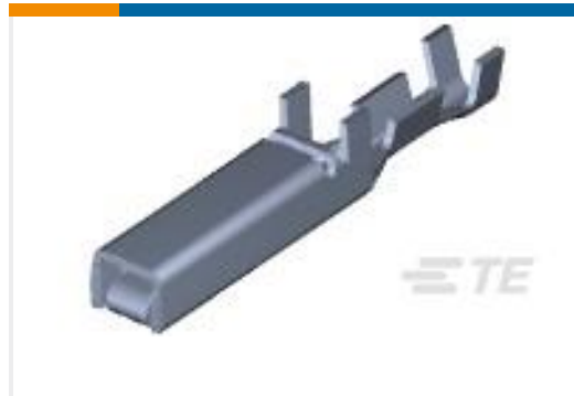
TE Part # 175216-2 DYNAMIC REC CONT. S L/P