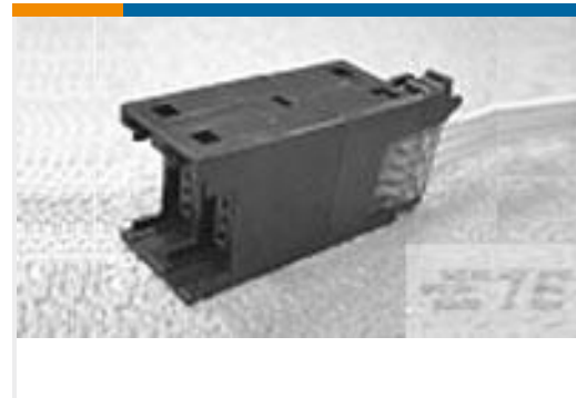
TE Part # 1473574-3 RITS.JUNCTION BOX 4D 3P P/M