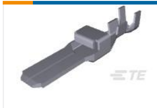
TE Part # 917804-2 DYNAMIC D-5 TAB CONT. S L/P