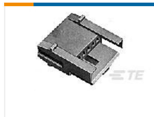
TE Part # 1-172211-0 10P CAP HSG F/H EI S CONN.