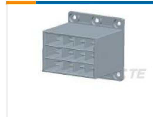
TE Part # 1903146-2 DYNAMIC D-5 DYNATAP 12P ASSY P /M BOTTOM