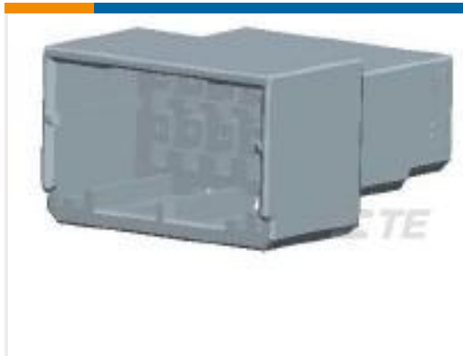
TE Part # 1-1903130-6 DYNAMIC 1200D TAB HSG 12P F/H