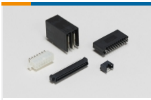
Standard Rectangular Connectors(12)