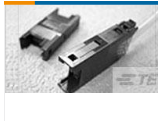
TE Part # 5-1473571-3 RITS.JUNCTION BOX 2D 3P F/H