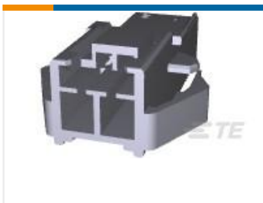
TE Part # 176292-1 UNIV POWER CAP HSG 2P P/MOUNT