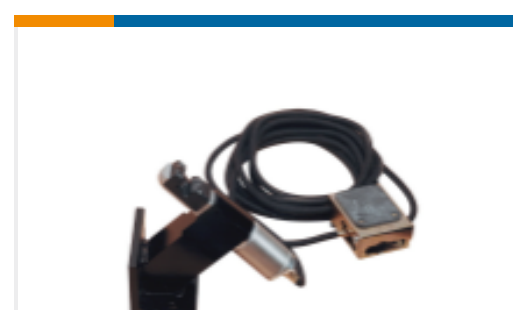
TE Part # 58338-1 MTA 50/100/156 PNEUMATIC BENCH MOUNT