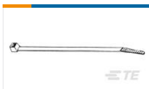
TE Part # 2-604771-9 CABLE TIE, NATURAL, 4" (1000)