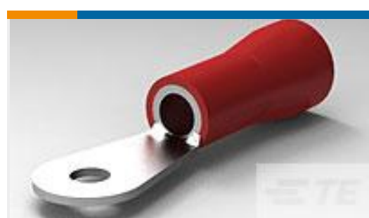
TE Part # 52041 TERMINAL,R PG 8 8