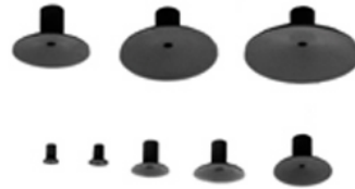
Selection of different sizes of vacuum cups.