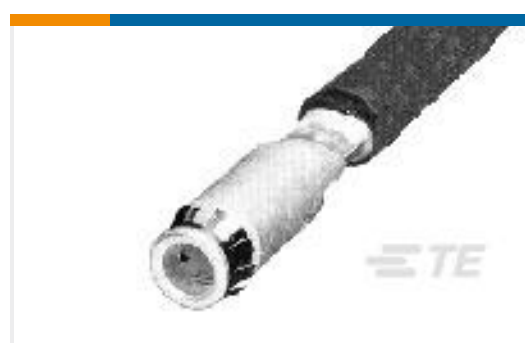
TE Part #193673-2 SKT ASSY., CRIMP, 4MM, 10AWG