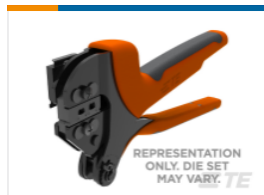
TE Part #2063409-1 SDE MICROTIMER 0.2-1.0mm2 ASSY