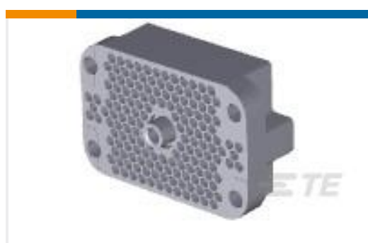
TE Part #202800-2 RECEPT ASSY, 160 POS, M-SERIES