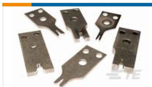
TE Part #1-2119784-3 CRIMPER, INSULO PREMIUM