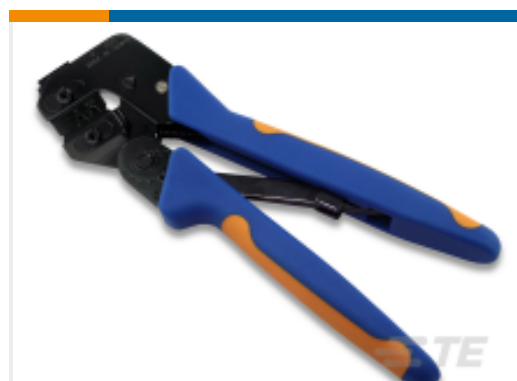
TE Part #1976143-1 SDE COMMERCIAL TOOL OR DIE