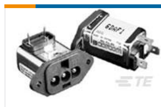
TE Part #2-6609075-9 15DAS1=F7993 S0