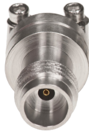
Common Interface ELF67