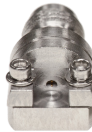
Narrow Profile ELF67-001