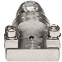
Standard Profile ELF67-002