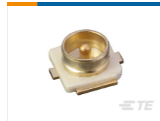
TE Part # CONMHF1-SMD-G-T U.FL/MHF1 Jack 50 Ohm PCB Surface Mount