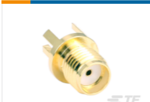
TE Part # L9000267-01 SMA Jack 50 Ohm .062 PCB Edge Mount gold