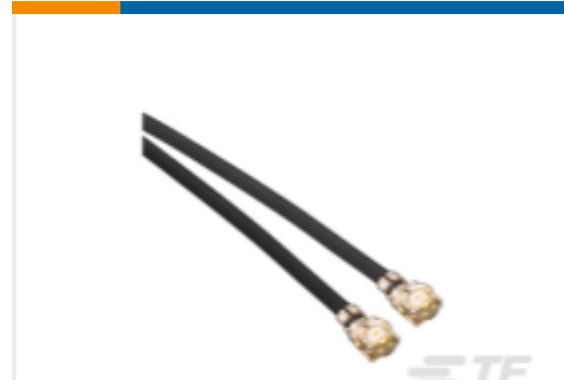
TE Part # CSG-UFFR-100-UFFR U.FL/MHF1 to U.FL/MHF1 100mm 1.37 OD