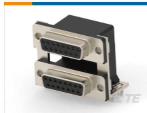
TE Part # 2454917-5 D-SUB , 15 POS RCPT OVER 15 POS RCPT