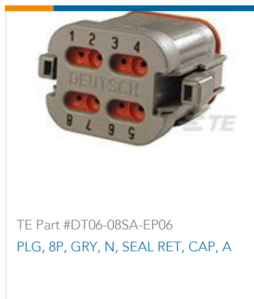
TE Part #DT06-08SA-EP06 PLG, 8P, GRY, N, SEAL RET, CAP, A