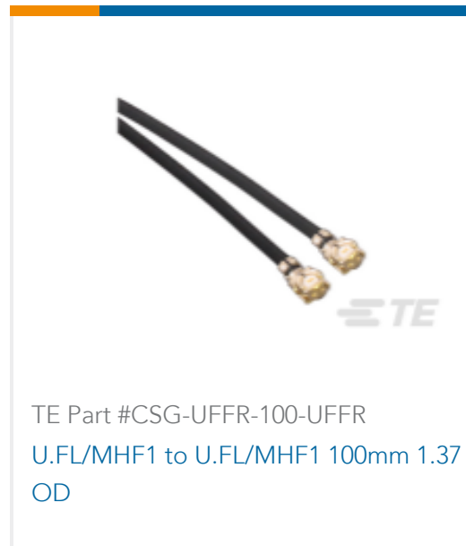
TE Part #CSG-UFFR-100-UFFR U.FL/MHF1 to U.FL/MHF1 100mm 1.37 OD