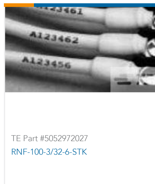
TE Part #5052972027 RNF-100-3/32-6-STK