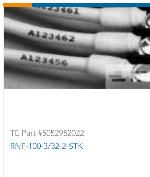
TE Part #5052952022 RNF-100-3/32-2-STK