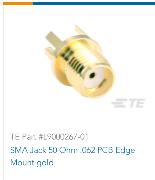
TE Part #L9000267-01 SMA Jack 50 Ohm .062 PCB Edge Mount gold