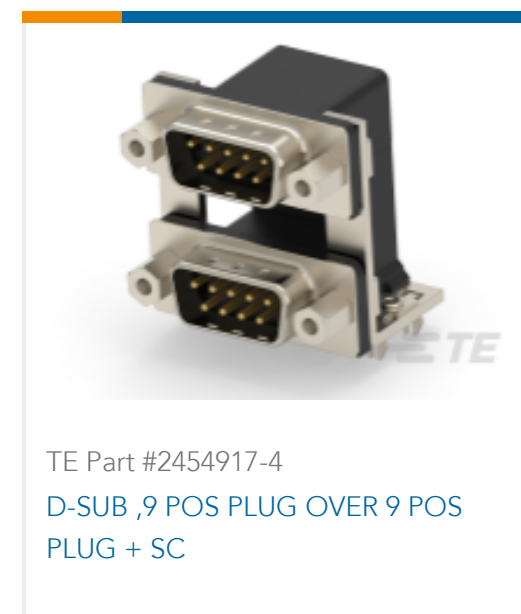
TE Part #2454917-4 D-SUB, 9 POS PLUG OVER 9 POS PLUG + SC