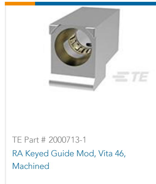
TE Part # 2000713-1 RA Keyed Guide Mod, Vita 46, Machined