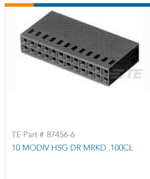
TE Part # 87456-6 10 MODIV HSG DR MRKD .100CL