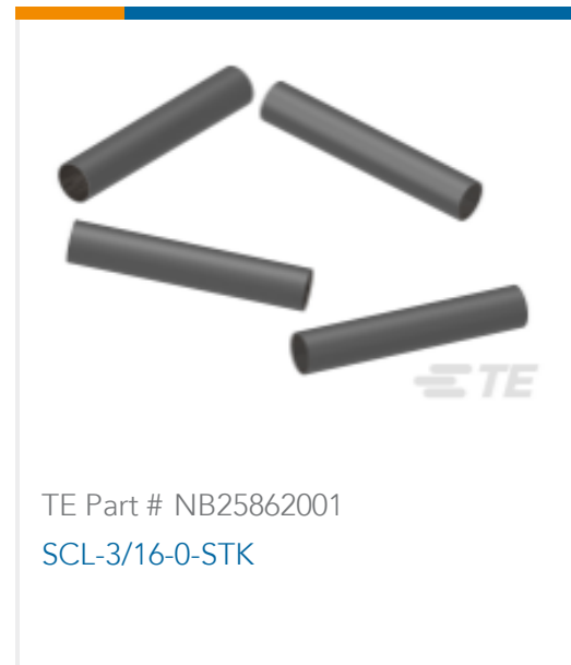
TE Part # NB25862001 SCL-3/16-0-STK