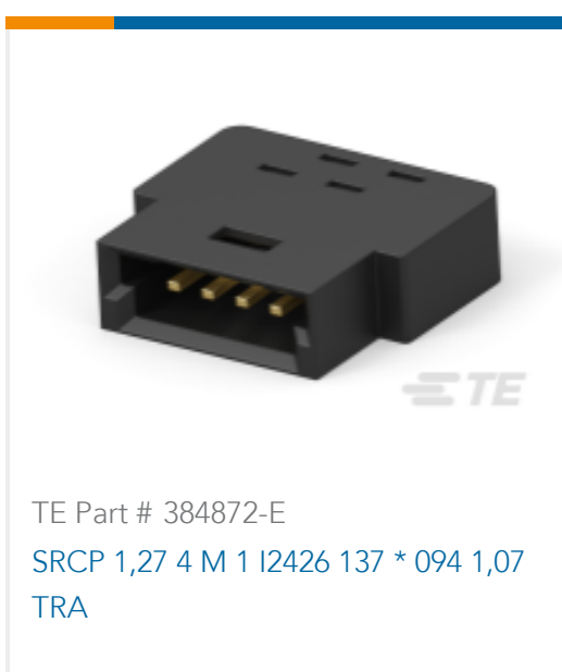
TE Part # 384872-E SRCP 1,27 4 M 1 I2426 137 * 094 1,07 TRA