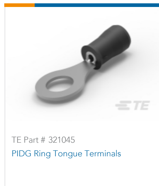
TE Part # 321045 PIDG Ring Tongue Terminals