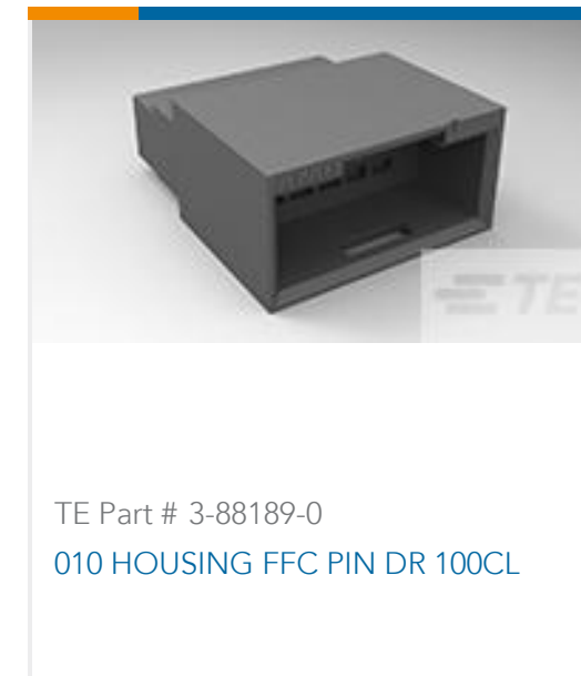
TE Part # 3-88189-0 010 HOUSING FFC PIN DR 100CL