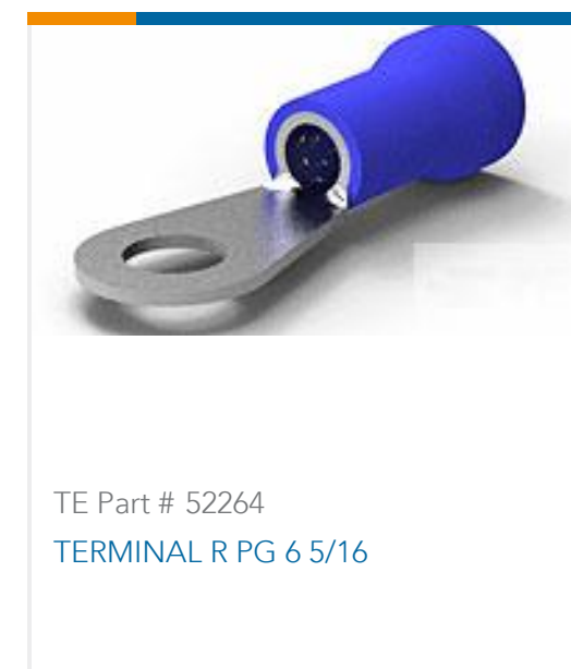
TE Part # 52264 TERMINAL R PG 6 5/16