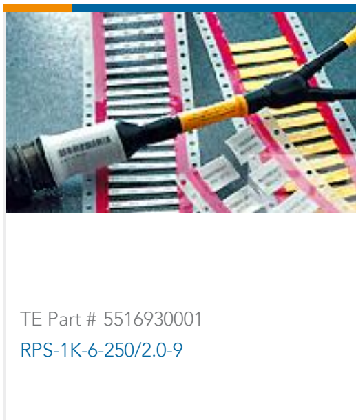
TE Part # 5516930001 RPS-1K-6-250/2.0-9