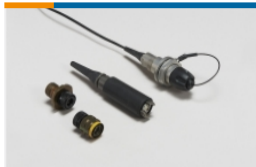
Expanded Beam Fiber Optics(21)