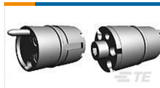
TE Part #1515739-1 INSERT ASSY, 2 X 1310/1550 SM, JR