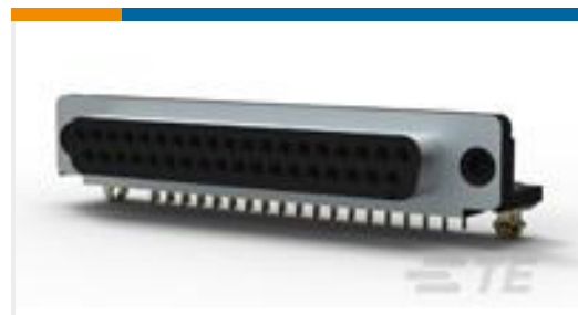
TE Part #5747847-4 37 MSFL RCPT RA 318 (IN,FM,BL)