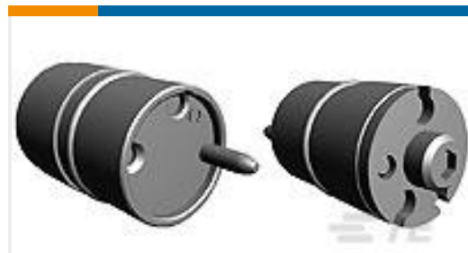
TE Part # 1515737-1 INSERT ASSEMBLY, 1xMM, PRO BEAM Jr.