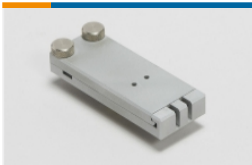
Curing Blocks, Ovens & Sleeves(1)