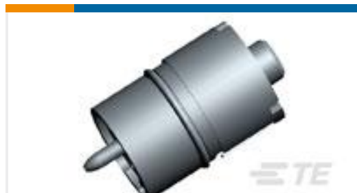
TE Part # 1515743-1 INSERT ASSEMBLY, 2xMM, PRO BEAM Jr.