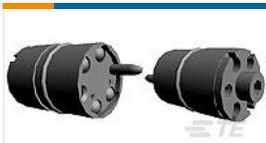
TE Part # 1515747-1 INSERT ASSEMBLY, 4xMM, PRO BEAM Jr.