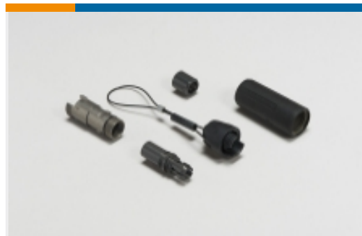
Expanded Beam Fiber Housings(5)