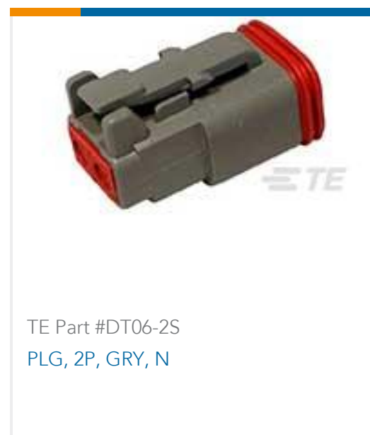
TE Part #DT06-2S PLG, 2P, GRY, N