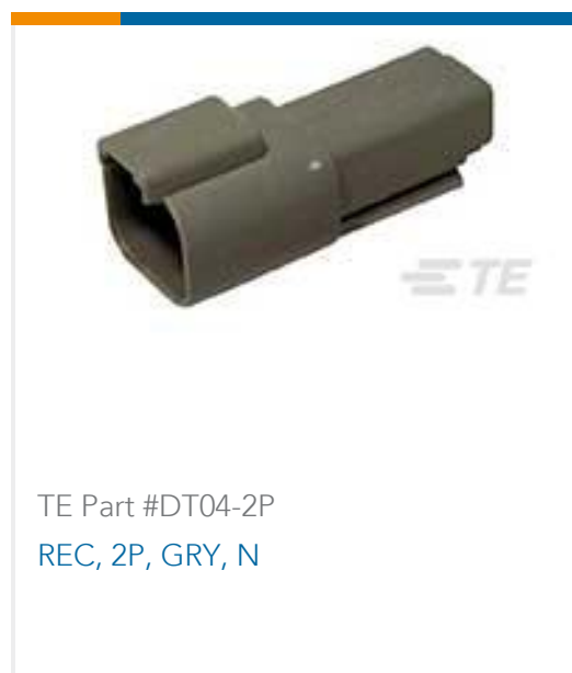
TE Part #DT04-2P REC, 2P, GRY, N