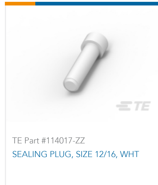
TE Part #114017-ZZ SEALING PLUG, SIZE 12/16, WHT