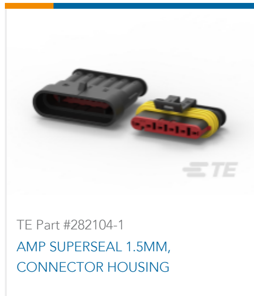
TE Part #282104-1 AMP SUPERSEAL 1.5MM, CONNECTOR HOUSING