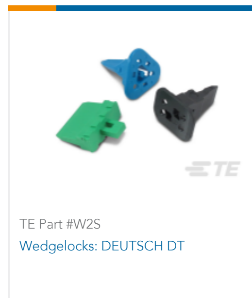
TE Part #W2S Wedgelocks: DEUTSCH DT