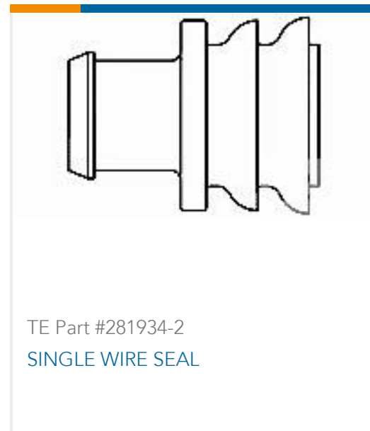
TE Part #281934-2 SINGLE WIRE SEAL