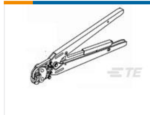
TE Part # 68026 DAHT TERMI-FOIL ASSY