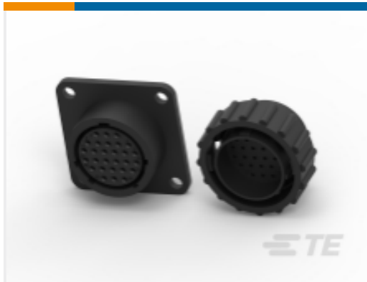
TE Part # 206433-1 CPC Connectors, Series 2