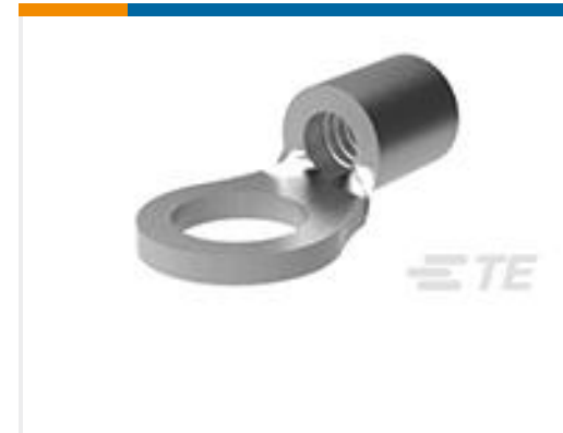
TE Part # 34123 TERMINAL,SOLIS R 16-14 10