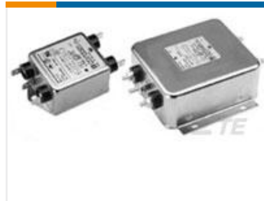
TE Part # 6609043-2 6VV1=F7251 S0