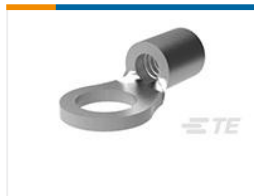
TE Part # 33457 TERMINAL,SOLIS R 12-10 10