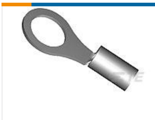
TE Part # 323062 TERMINAL,SOLIS R HR 12-10 10