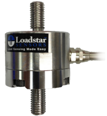
(With tension adapter TX-RSB3)