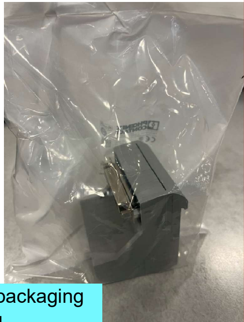
Proposed packaging in auto bag