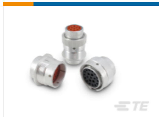
TE Part #HD34-24-19SE-059 DEUTSCH HD30 Housings