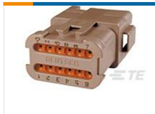
TE Part #DT04-12PD-BE02 REC, 12P, BRN, N, ENH KEY, CAP, D