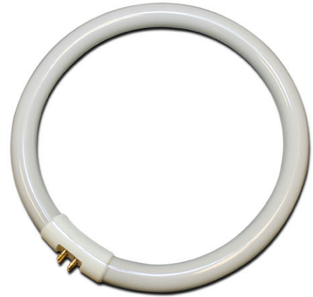
Replacement Bulb Item: BULB-T5