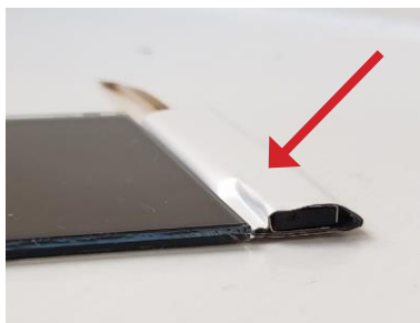
Damaged -01 unit