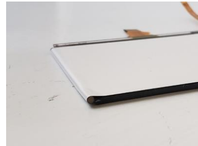
Properly rolled -06