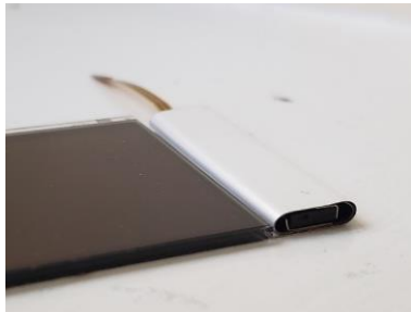
Properly rolled -01