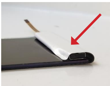
Damaged -03 unit