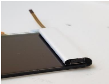
Properly rolled -03