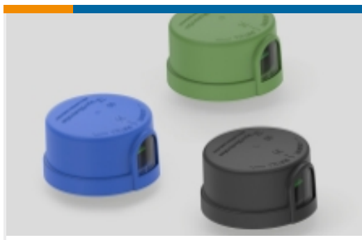
Street Lighting Photocells(9)