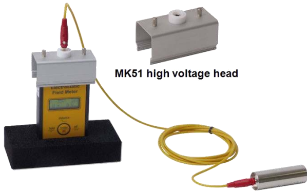
MK51 high voltage head