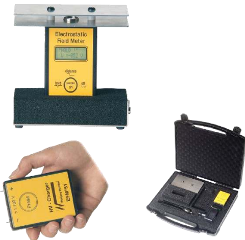
EFM51.CPS Charge Plate Kit

7100.EFM51.VK: EFM51 Verification Kit 7100.EFM51.WT: EFM51 Walking Test 7100.EFM51.CPS: EFM51 Charged Plate System 7100.EFM51: EFM51 Electrostatic Field Meter