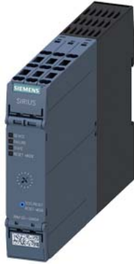
Reversing starter, 3RM1, 500 V, 0 - 0.12 kW, 0.1 - 0.5 A, 24 V DC, spring-type terminals