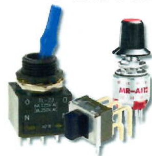
Various NKK Products will be Discontinued

Due to containing an environmentally restricted material, Dechlorane Plus, NKK Switches will be discontinuing a limited number of products as outlined on the following table. Guidelines regarding Dechlorane Plus will be coming into effect in the near future, and NKK prefers to be proactive regarding environmental responsibility. The discontinued products will include standard and custom part numbers.