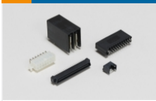
Standard Rectangular Connectors(12)