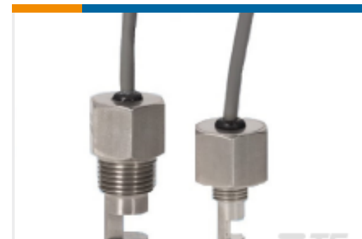
TE Part # LL01-1AB04 LL01 1/2" NPT 48" CABLE 80C