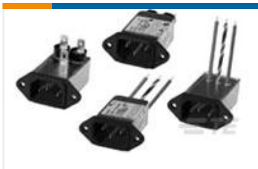
TE Part # 6609017-5 3EC1=F7282 S0