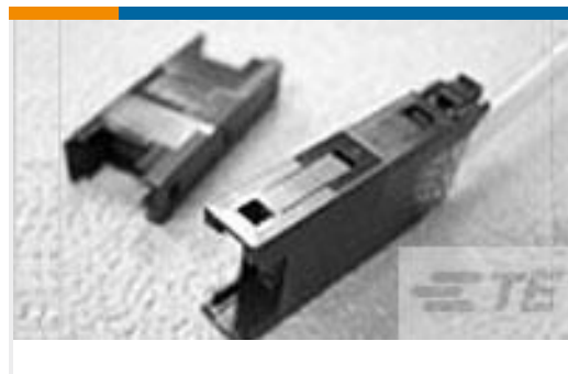
TE Part # 5-1473571-3 RITS.JUNCTION BOX 2D 3P F/H