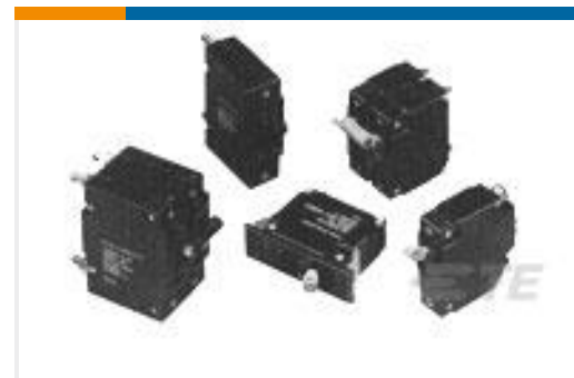
TE Part # 1-1393253-7 W68-X2Q110-10=M6/M7/M9/W6/W7