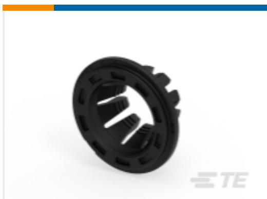
TE Part # 2394112-1 H&S 35mm, Cable clip