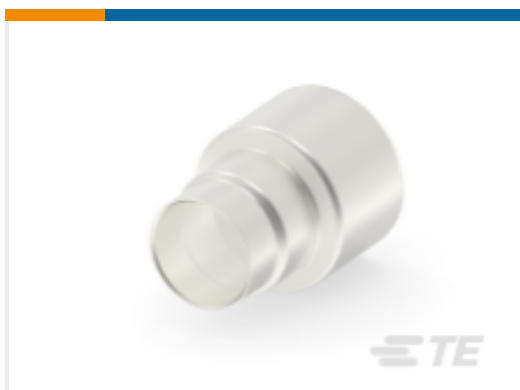
TE Part # 2383853-6 H&S 35mm, Shield Sleeve