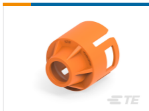
TE Part # 2394113-1 H&S 35mm, Cable cover