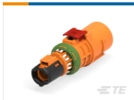
TE Part # 2394085-1 Pre-ASSY, Finger Access, Code A