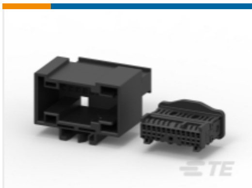
TE Part # 2309644-1 MQS, CONNECTOR HOUSING