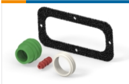
Connector Seals & Cavity Plugs(3)