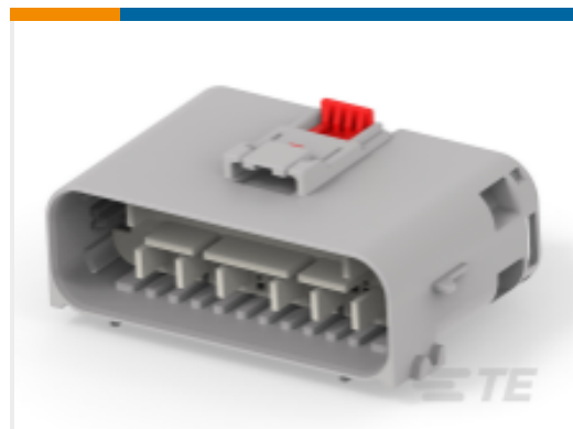
TE Part # 1-2301461-4 30POS, HYBRID, TAB HSG ASSY, SLD, COD B