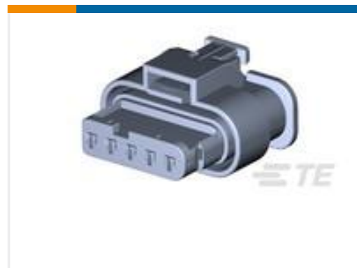
TE Part # 2-1718806-1 5POS, MCON 1.2 LL REC SEALED COD B