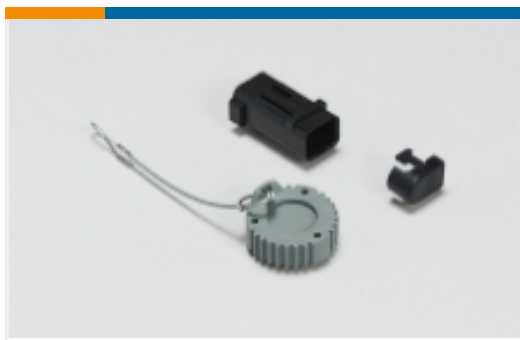
Automotive Connector Caps & Covers (5)