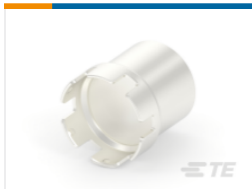
TE Part # 2371243-1 CU ALLOY, OUTER FERRULE, ICT CVE