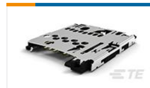
TE Part # 2201778-1 MICRO SD PUSH PUSH LOW PROFILE TYPE