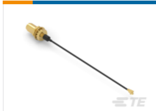
TE Part # 2016682-2 RF CA,UMCC1 TO SMA JACK,1.13MM, L100MM