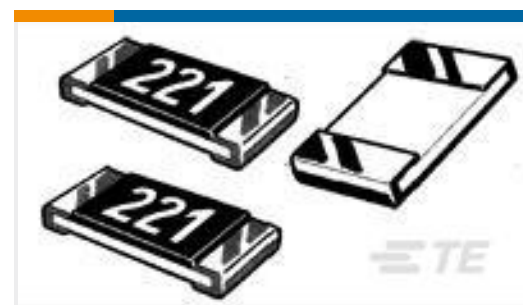
TE Part # 2-2176070-2 3521 75R 1% 2W