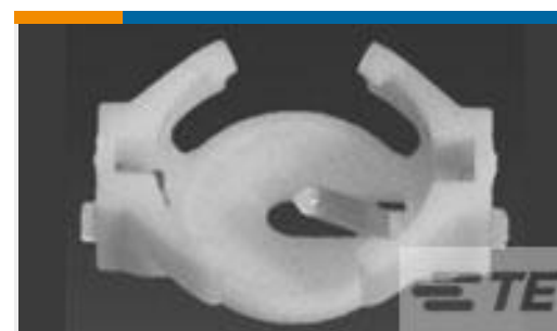
TE Part # 1376164-1 BATTERY HOLDER ML621 ASSY