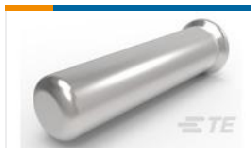
TE Part # 50935 SOCKET, MIN-SPR AU-AU SER-1