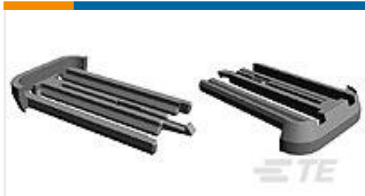
TE Part # 368388-1 MQS RETAINER HSG FOR 40P