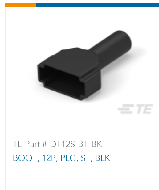
TE Part # DT12S-BT-BK BOOT, 12P, PLG, ST, BLK