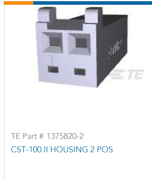
TE Part # 1375820-2 CST-100 II HOUSING 2 POS