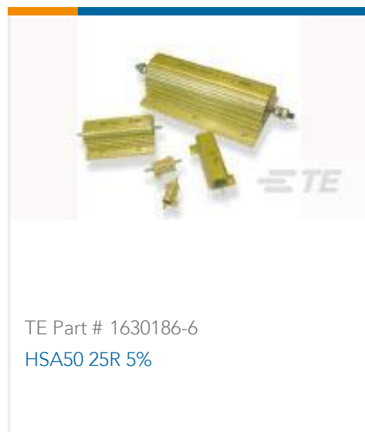
TE Part # 1630186-6 HSA50 25R 5%