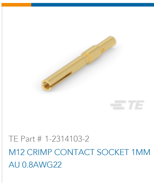
TE Part # 1-2314103-2 M12 CRIMP CONTACT SOCKET 1MM AU 0.8AWG22