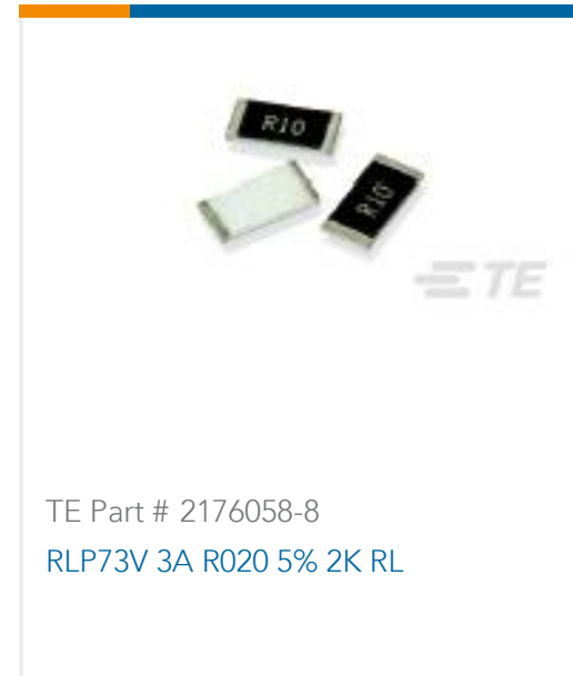
TE Part # 2176058-8 RLP73V 3A R020 5% 2K RL