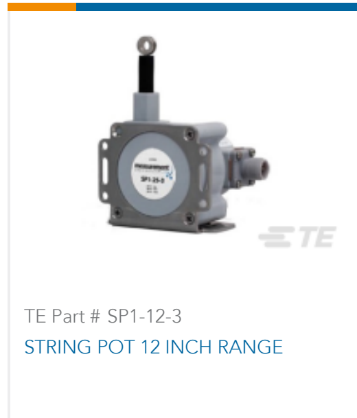
TE Part # SP1-12-3 STRING POT 12 INCH RANGE