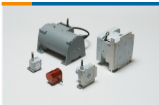
Cable Actuated Position Sensors(22)