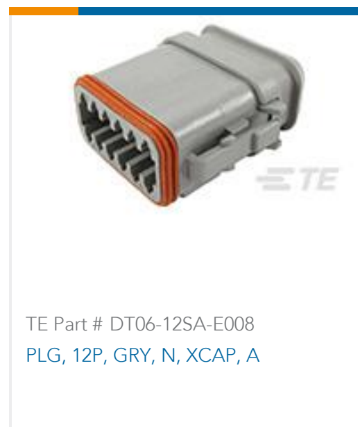
TE Part # DT06-12SA-E008 PLG, 12P, GRY, N, XCAP, A