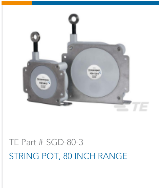
TE Part # SGD-80-3 STRING POT, 80 INCH RANGE