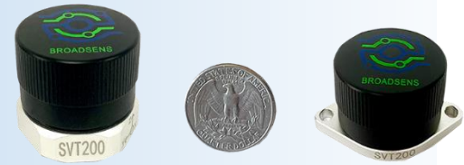
True real-time wireless vibration sensor SVT200-V

Ultra-low power wireless vibration & temperature sensors SVT200-V, SVT30-V and SVT400-V provide true real-time machine condition monitoring continuously 24/7 non-stop. The sensor samples x, y and z axes acceleration continuously, and switches to 6.4kHz sampling rate immediately if the acceleration exceeds 0.1g in any of the axes. The sensor acquires a fixed number of samples, calculates velocity RMS and acceleration RMS value, and sends the result plus temperature to the wireless gateway.